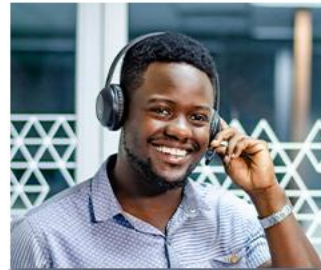
Dedicated Team Members align with your time zone