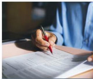
No long-term contracts