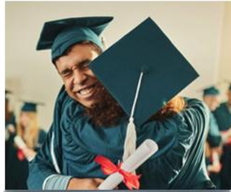
University-Educated Team Members