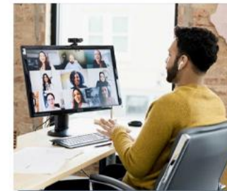
No work from home