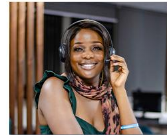
Team Members speak the “Queen’s English”